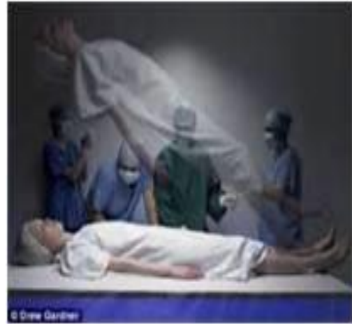
Fig. 6. Out-of-body experience

AWE proposes that the criterion for direct evidence of genuine NDE is the ability of the patient to acquire specific and detail knowledge (as oppose to general knowledge) that the patient has no conceivable means of knowing. Under this stringent criterion, several of these direct and convincing NDE cases are cited below: