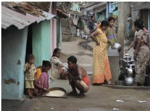
Fig 2. Basic food and shelter

The two basic necessities for survival of all creatures are food and shelter. How do we define basic necessities? Do we eat to live or live to eat? On the one hand, about 80% of the world's population in economically marginalized countries have very humble living conditions with room for improvement (Fig. 2). On the other hand, affluent society seems to have gone to the other extreme.