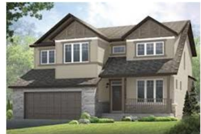
Fig 4. Luxurious home in upscale neighbourhood

the body with good food is instinctive to humans and animals alike. However, a vast majority of people in affluent societies over emphasized on nutrition, organics and tonic supplements to achieve longevity (Fig. 3). Likewise, when it comes to shelter, the desire to pursue upscale neighbourhood becomes insatiable (Fig. 4). Most people in affluent society have their state of mind determined by materialistic values typically cars, clothes, money, vacations and real estates. This endless pursuit of prestige and status only result in disproportionate greed, craving and stress of “keeping up with the Jones”. Therefore,