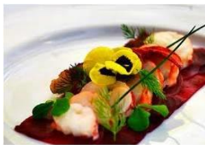
Fig 3. Sumptuous food

Food is a primitive desire. Nurturing and nourishing