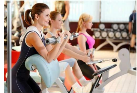
Fig 5. Gym mania

The gymnasium has become the most happening place today as fitness-frenzy takes over the young and old alike (Fig. 5). A good sign, but moderation is the key. Indeed, regular exercises contribute to good physical health, but holistic health has three aspects; physical, mental and spiritual. Since the last 2 aspects are more abstract, most people pay less attention as compared to the more visible and tangible physical health. Mental and spiritual health require a mature abstract mind to grasp their reality. This also explains why mental health and spiritual wellness tend to be neglected and under-valued.